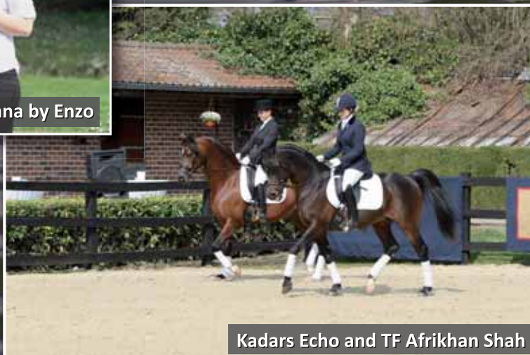
Kadars Echo and TF Afrikhan Shah