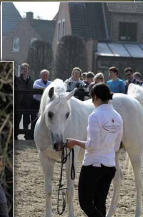
Nag Olla Bez