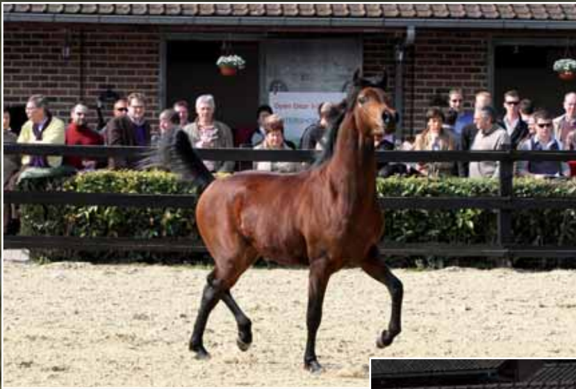
Psynselino by Borsalino K